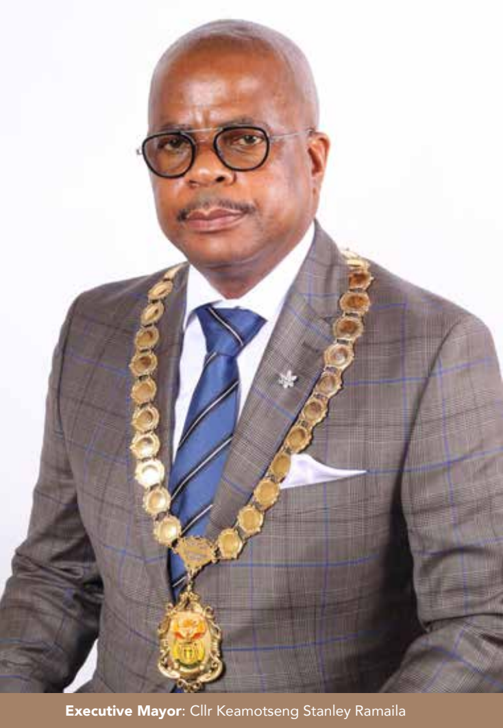
Executive Mayor: Cllr Keamotseng Stanley Ramaila