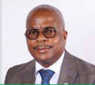
Executive Mayor Cllr Keamotseng Stanley Ramaila